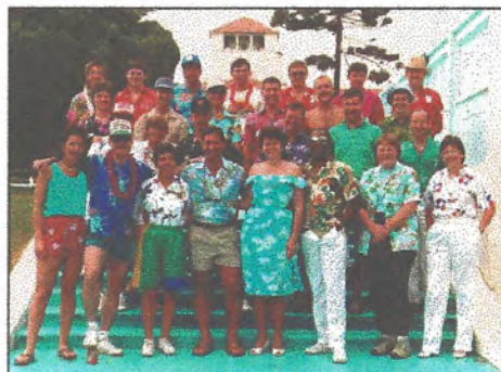
Remember this??? Let's do it again!!